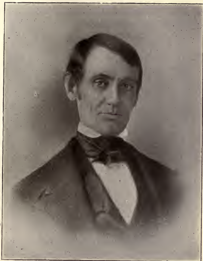
Earliest Portrait of Lincoln, 1848